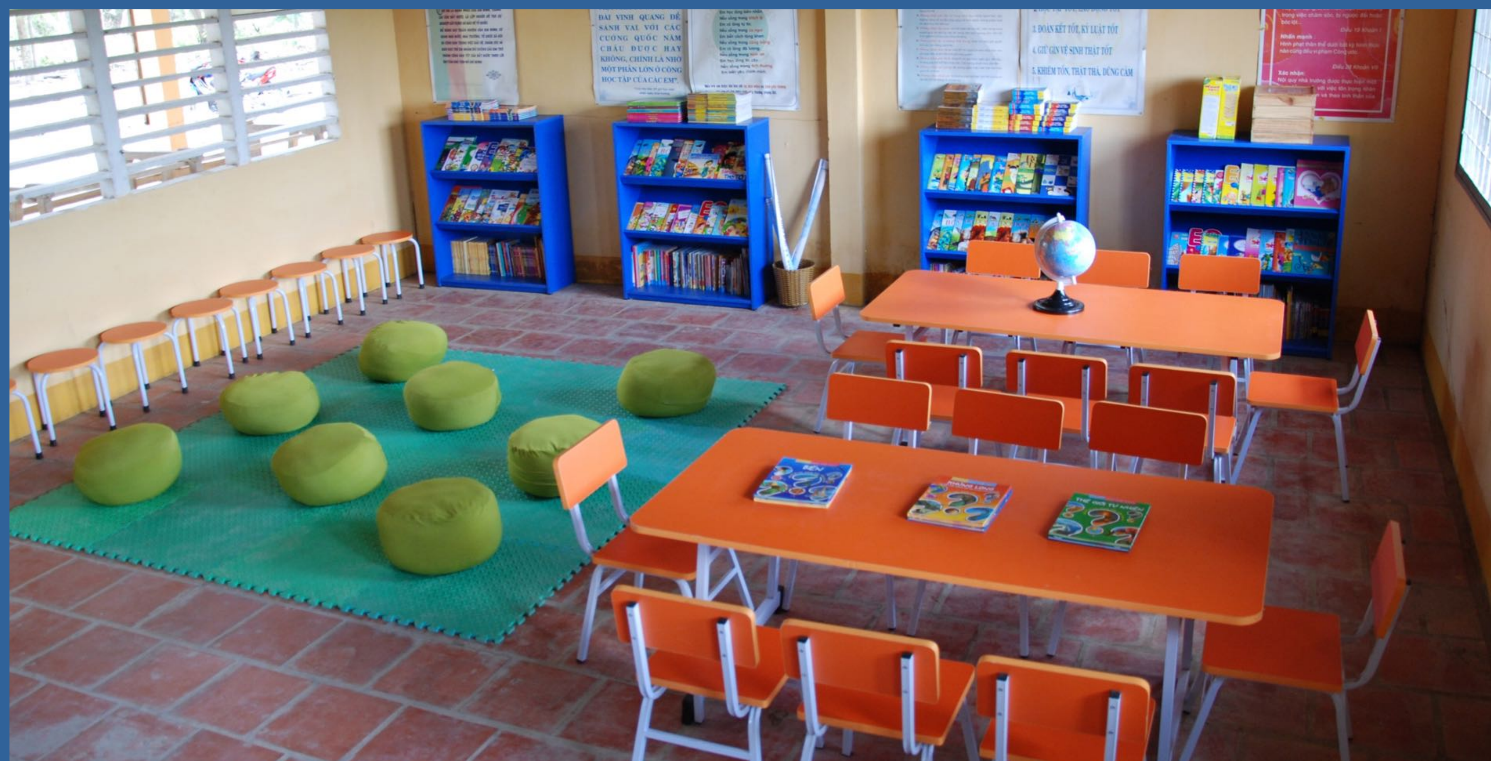
Reading Rooms for large schools