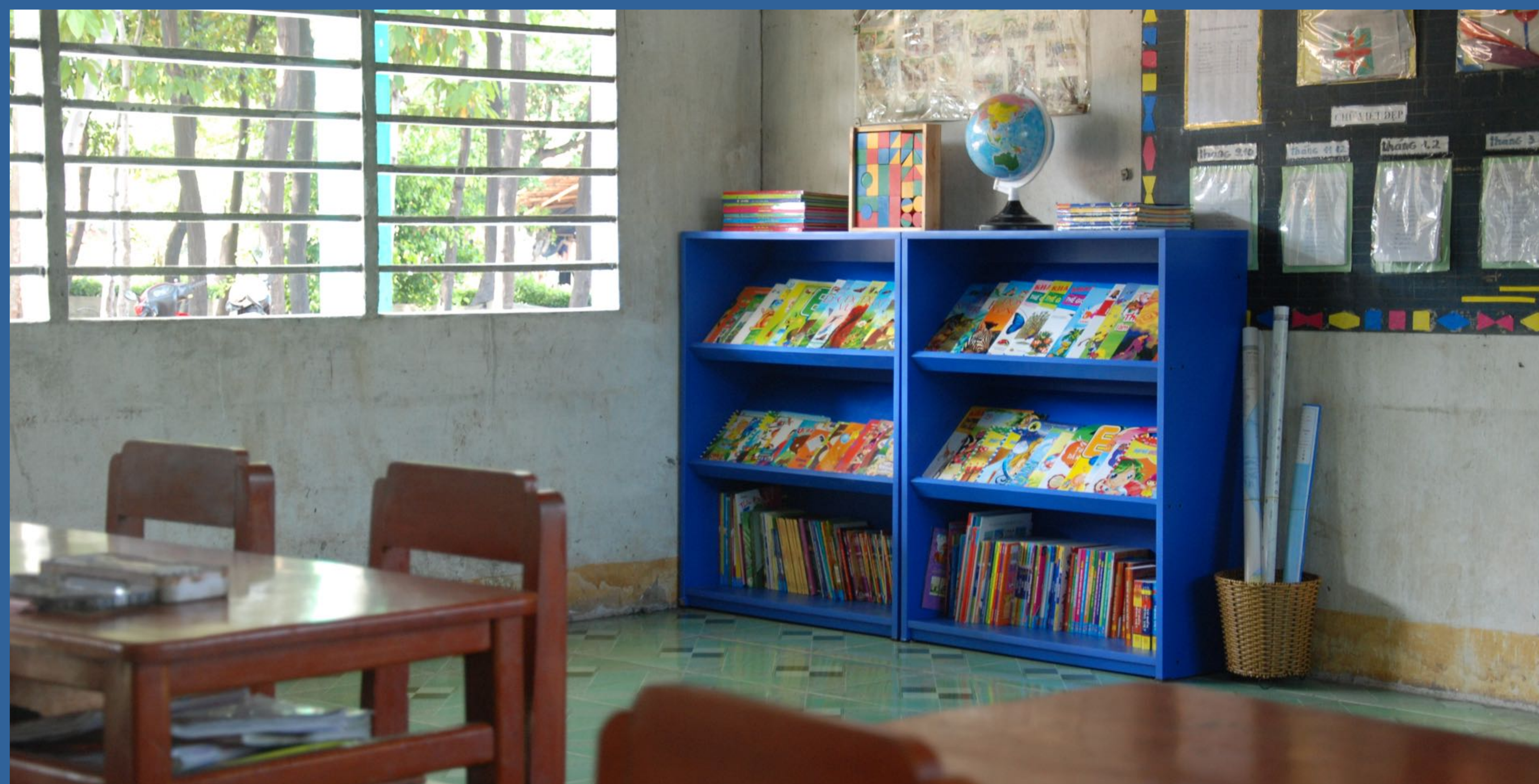
Reading Corners for small schools