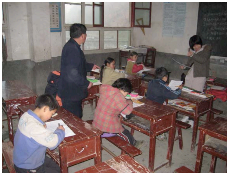
The Library Project staff working with the students, asking what books they like to read.