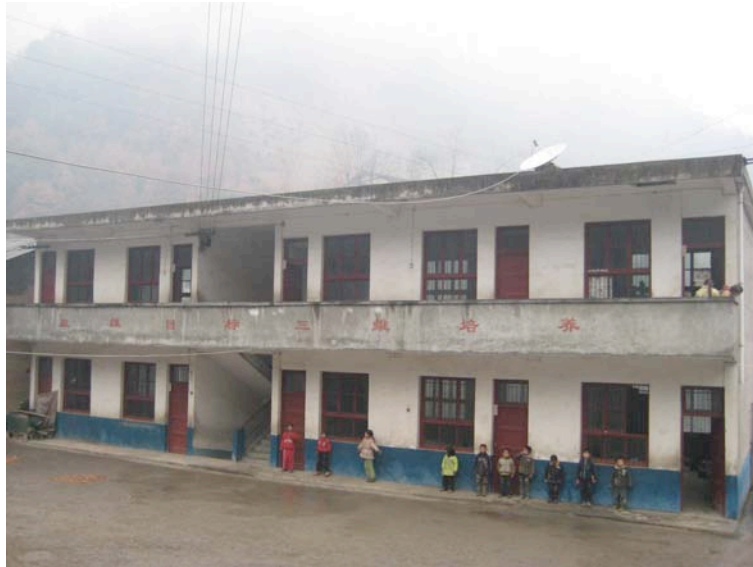
The school and its surroundings