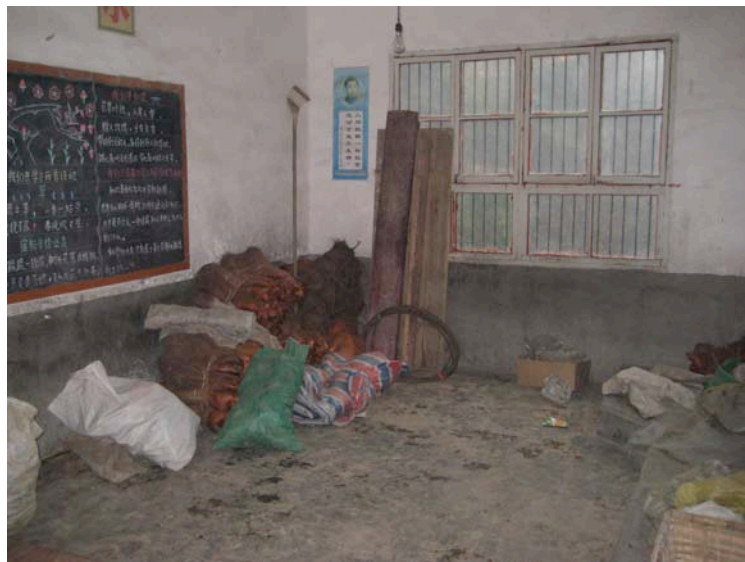
This room will be transformed into a library with over 500 Chinese language children's books