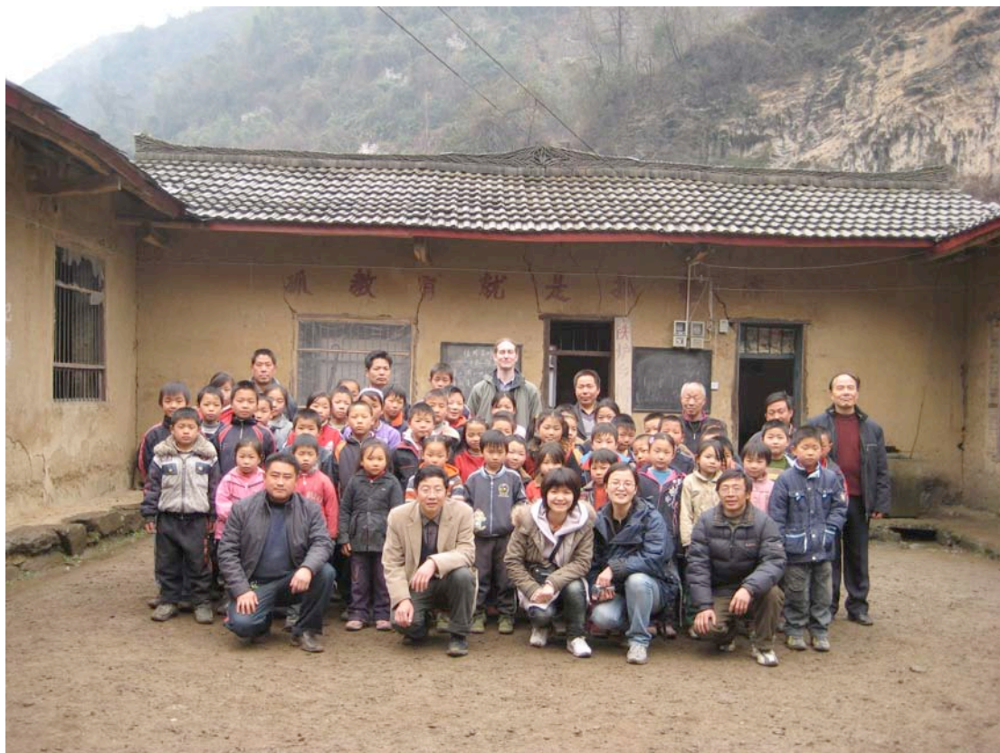
All the students and teachers along with The Library Project team posing for a photograph