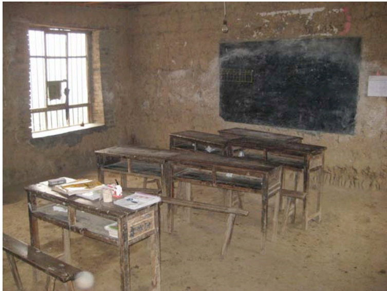
A typical classroom that is made of mud and rocks.