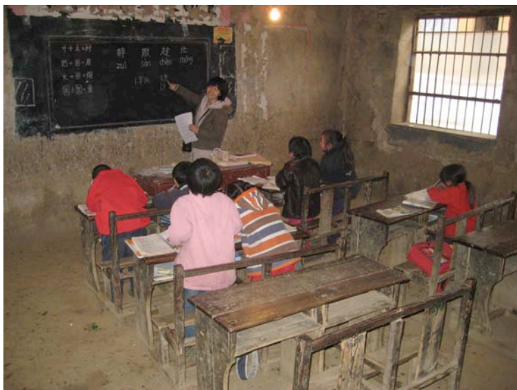
The Library Project staff working with the 1 st grade class, asking what books they like to read.