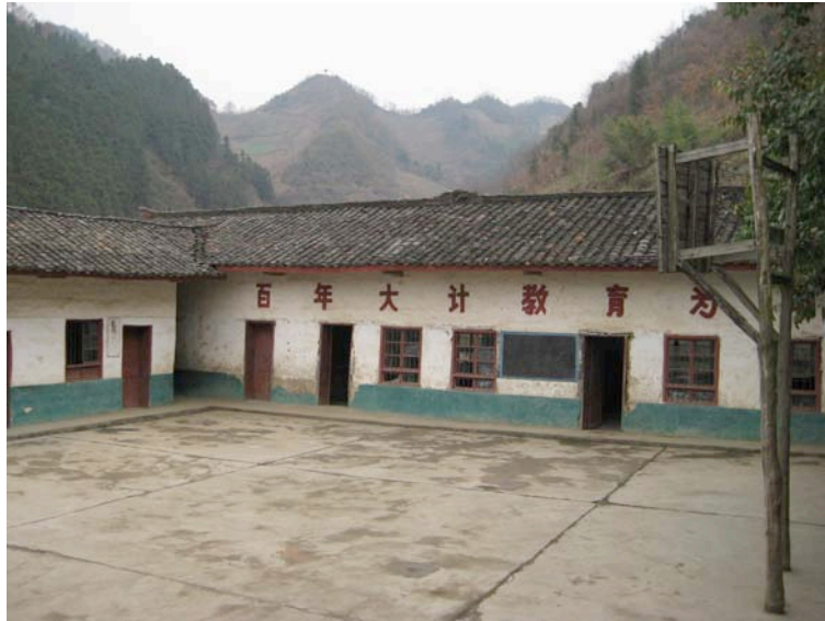
The school and its surroundings