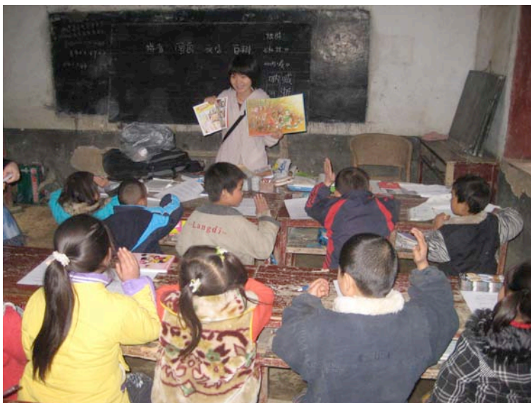
The Library Project staff working with the students, asking what books they like to read.