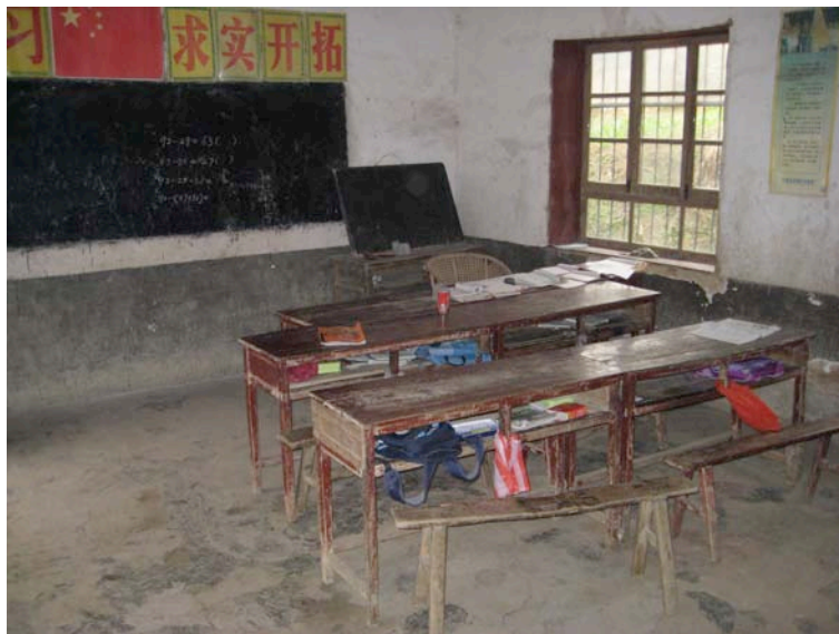
Their 4 th grade classroom.