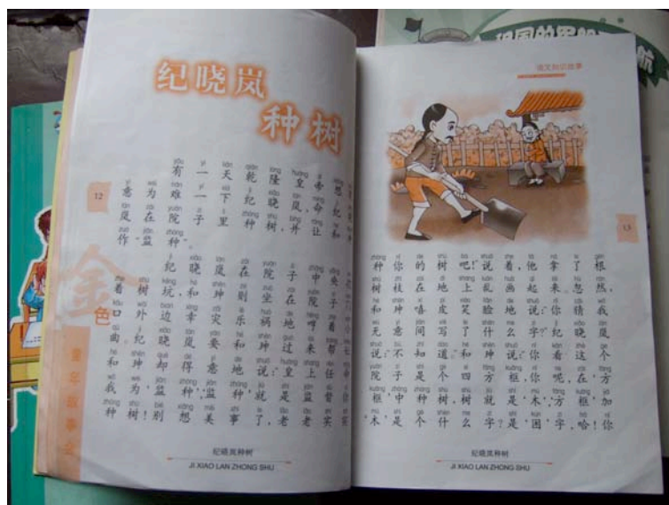
One of the five books found in the Jia Ping Elementary School library.