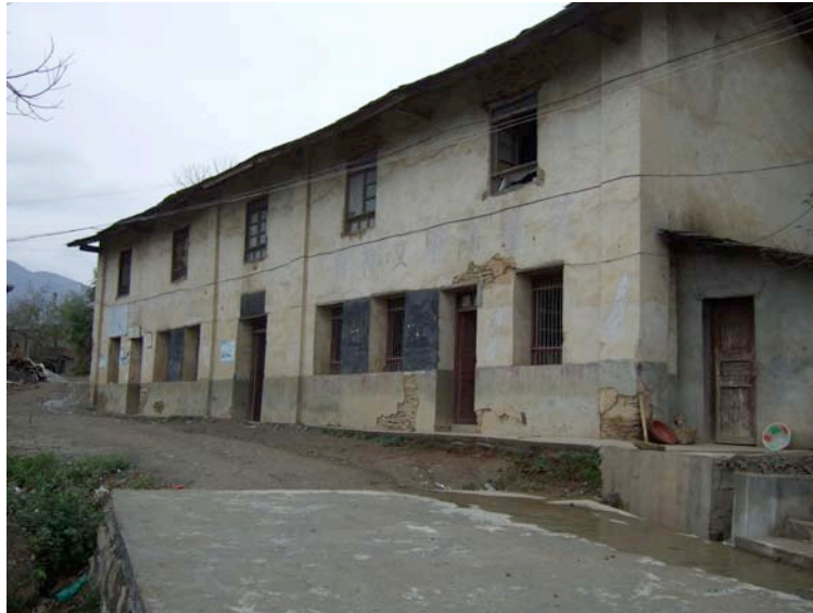
The school and its surroundings. Jia Ping is in a very remote region of Zi Yang County.