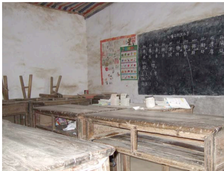
A typical classroom.