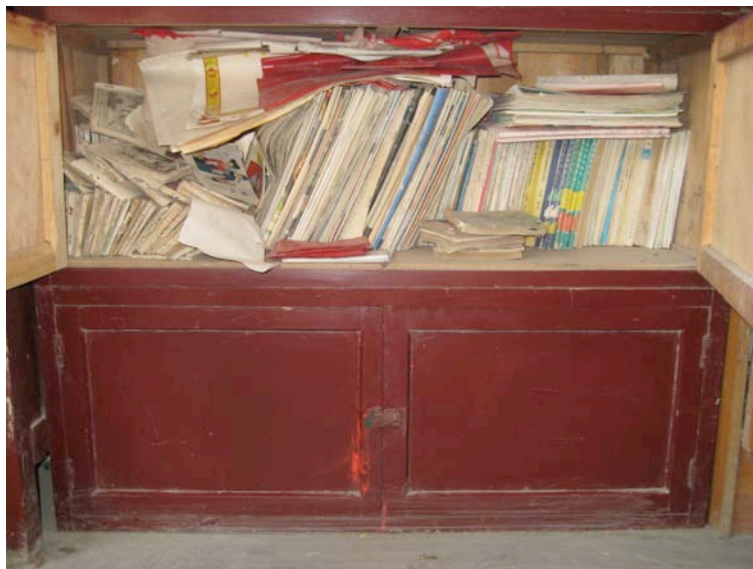
The current library has very old books that are not age appropriate.