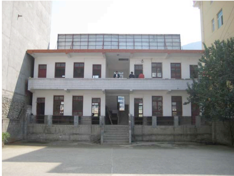
The school and its surroundings