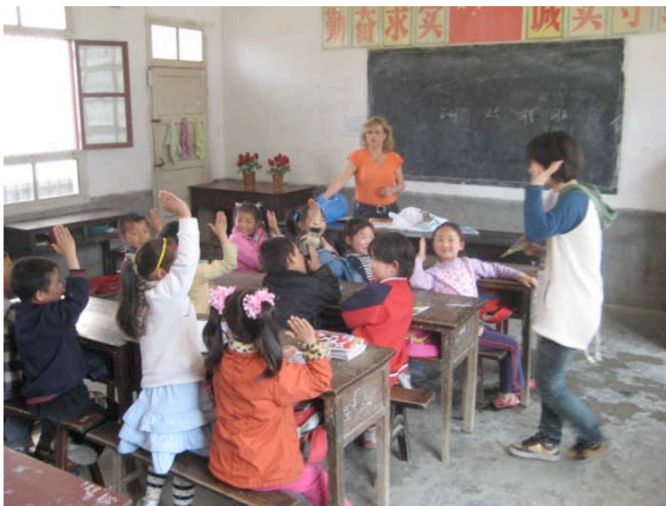
The Library Project staff working with the students, asking what books they like to read.